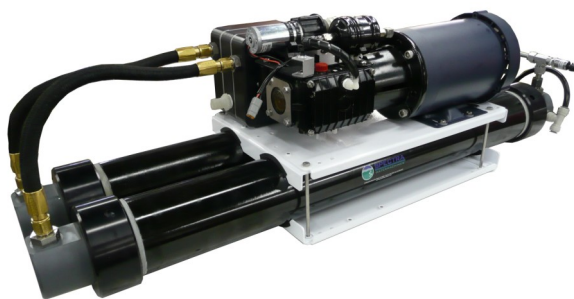
Pearson Pump with Spectraflux™ Membrane assembly

Dimensions 57"L x 24D x 45"H Approx 300 Lb 145cm L x 115cm W x 45cm H Approx 136 kg